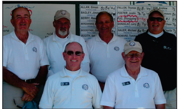
The Villages gang at the Rio Pinar FJT event.

This year will include more than 250 days of competition including 25 State Championships and over 40 qualifying events for USGA National Championships. New to the schedule is the Junior Match Play Championship which will feature boys and girls in two age divisions at two sites in Orlando. In addition, the inaugural Foundation Member-Guest will be played at The Fox Club in October. The Match Play Championship will now have qualifiers for players hoping to advance to the Championship at Sawgrass CC . The 90th Amateur Championship is right around the corner with 13 qualifiers across the state so please sign up to help in your area. These qualifiers are one day events with the Championship at Innisbrook Resort and Golf Club , just outside of Tampa. Throughout the year, competitors are trying to earn points in events to advance to the biennial Florida Cup . We hope to see many of you as the Championship season gets underway.